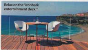
Relax on the ironbark entertainment deck.