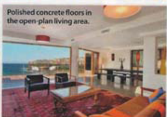
Polished concrete floors in the open-plan living area.