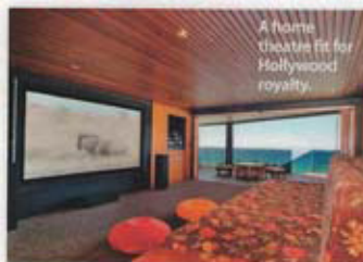
A home theatre fit for Hollywood royalty.